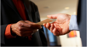
Create high quality connections into your future career with dynamic small businesses!